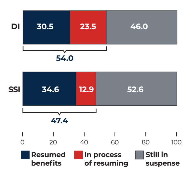
Figure 2. Benefit suspension status at interview among beneficiaries with a recent earnings-related suspension (percentage)

Note: Status was self-reported.